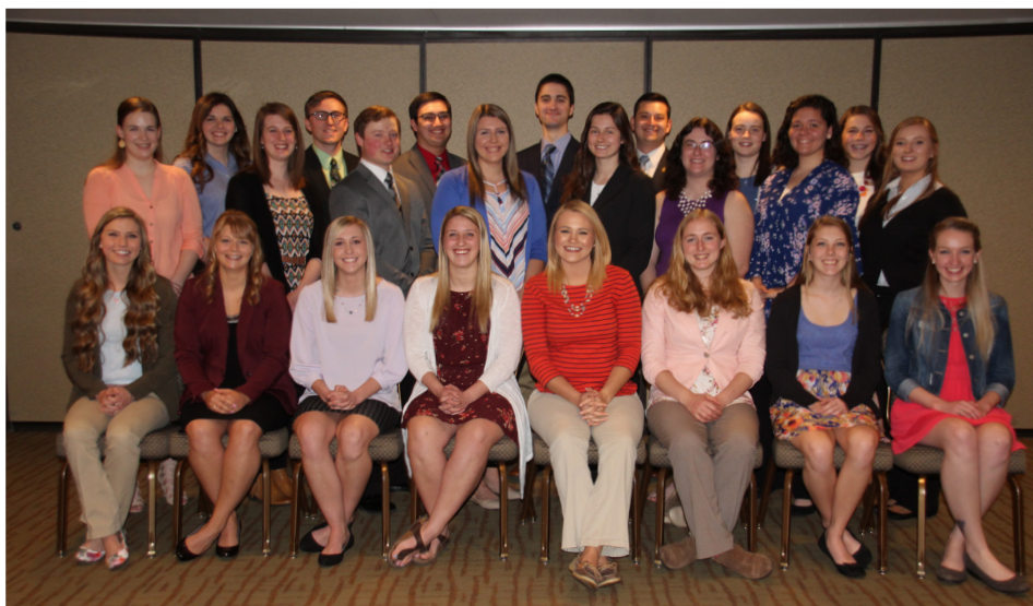
Students attending 2018 MDMSF Annual Meeting